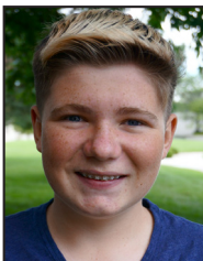
Cody Drap Race